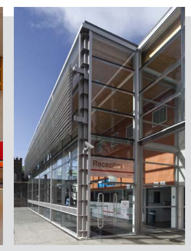
Mt Eden Prison gate house, Auckland - security glass facade