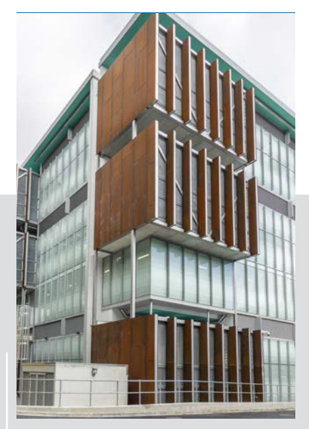
Mt Eden Correctional Facility AUCKLAND