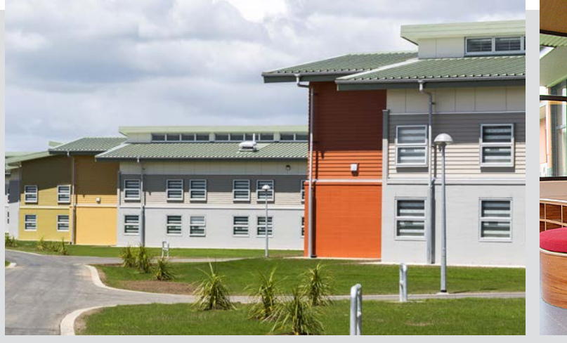
Wiri Prison, Auckland - security windows with bespoke sash.