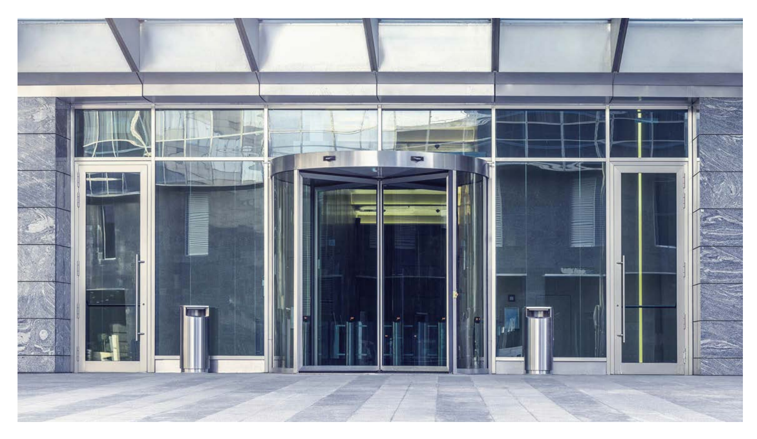
SÄLZER security doors can integrate automated fittings, access control units and escape door technology.