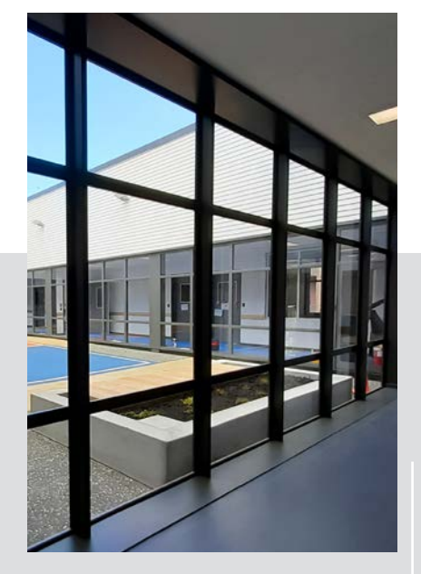
Mason Clinic WDHB

We exclusively use local powder coaters who have stringent chemical handling processes and reuse or responsibly dispose of all waste powder.