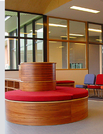
Youth Justice, Christchurch windows installed with specialist security glass.