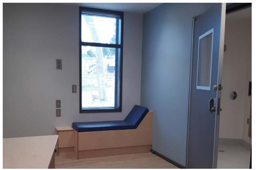
Mason Clinic E Tui Tanekaha, Auckland (for mentally disabled offenders) - the windows provide security and offer a domestic aesthetic to the building.