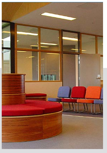
Youth Justice CHRISTCHURCH