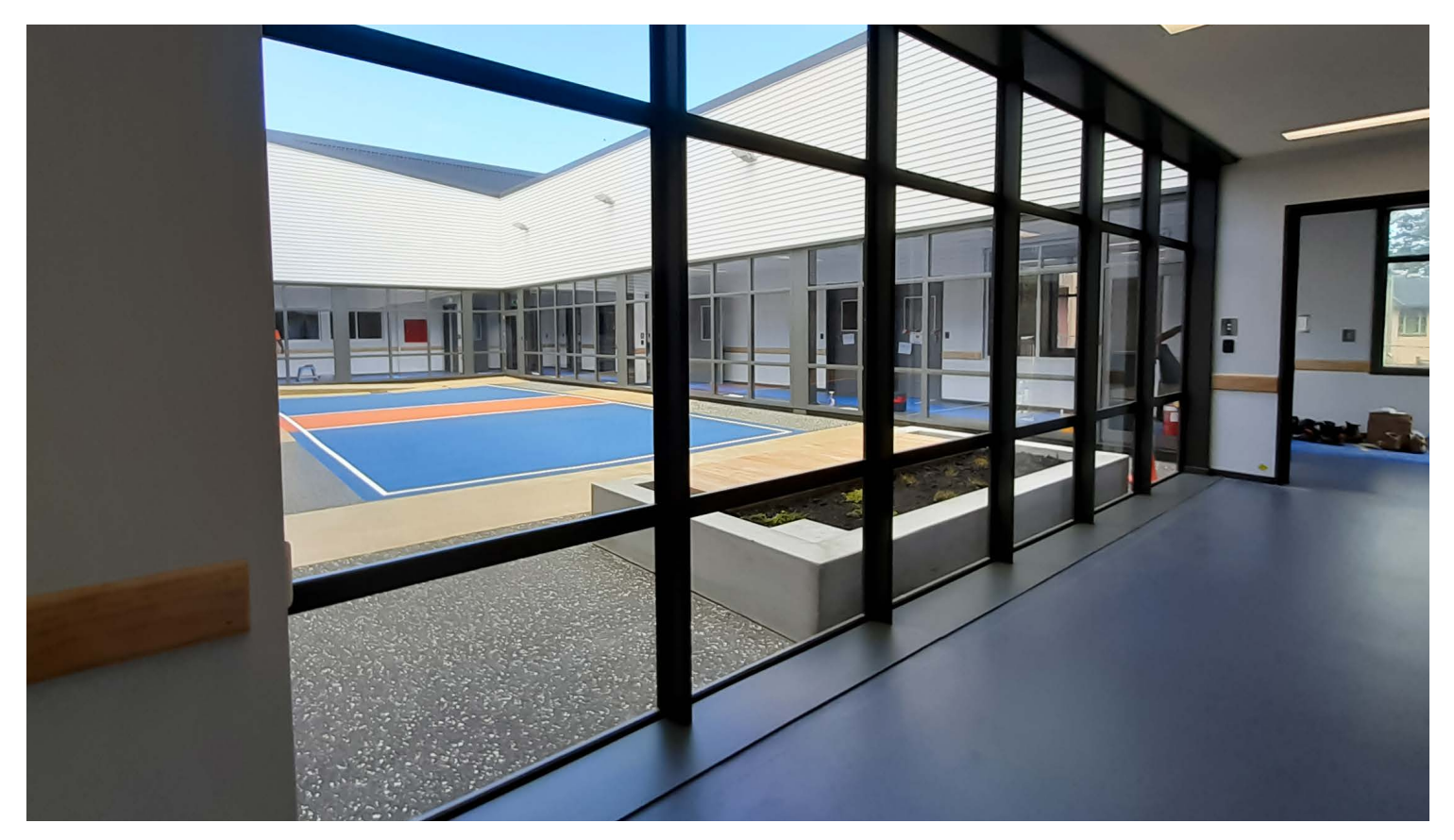
Mason Clinic WDHB - DeltaGuard™ security windows surrounding the interior courtyards