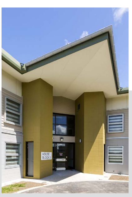
Wiri Prison AUCKLAND