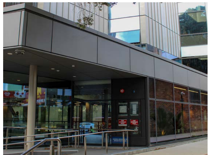
UOA Parkwest 507 - PW400 Suite to wind lobbies