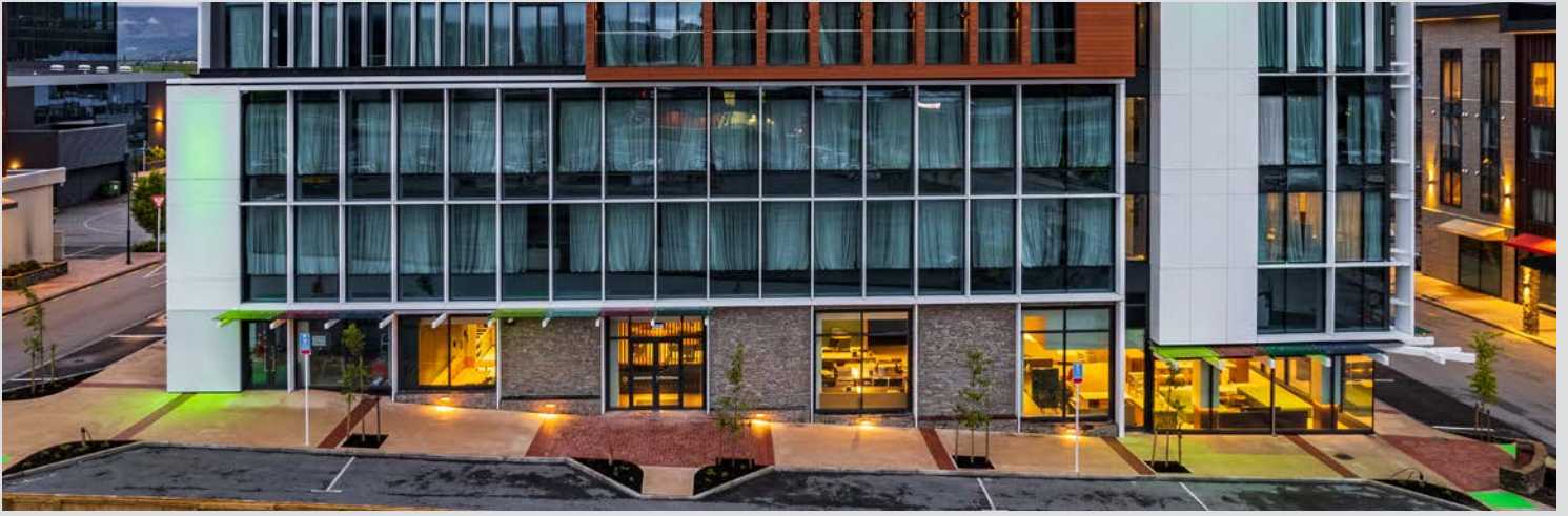
Holiday Inn Remarkables Park, Queenstown - PW400 Unitised Curtainwall Suite to the ground floor