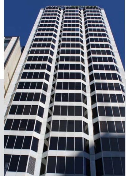
191 Queen St AUCKLAND