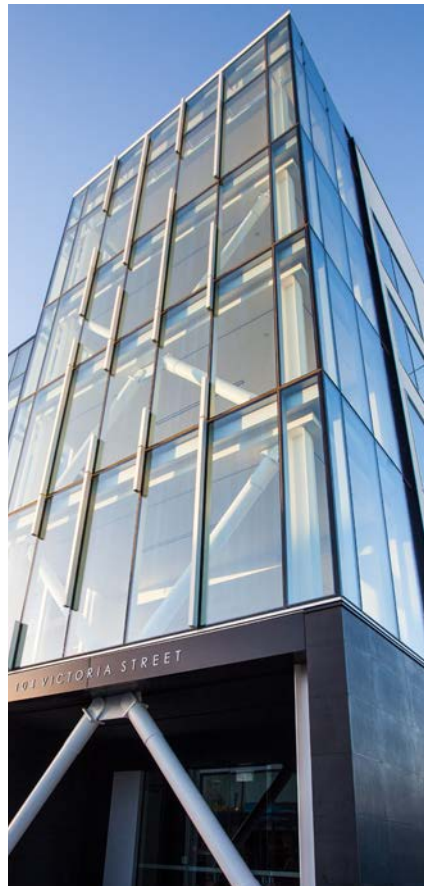
104 Victoria Str, Christchurch - PW400 Unitised Curtainwall with integrated vertical fins