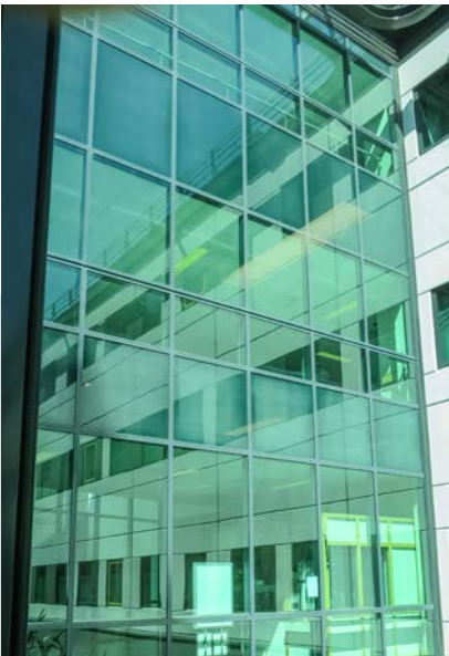
Middlemore Hospital AUCKLAND

We exclusively use local powder coaters who have stringent chemical handling processes and reuse or responsibly dispose of all waste powder.