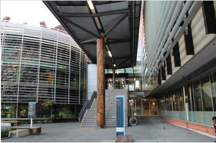
Waitakere Civic Centre, Auckland - PW400 Unitised Curtainwall installed as secondary glazing to Civic building and primary curtainwall to Admin block.