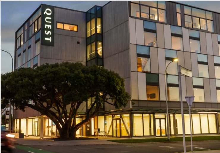
Quest Hotel, Takapuna - PW400 Unitised Curtainwall Suite to the ground floor