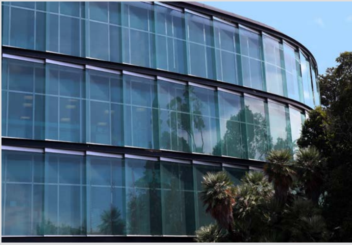
UOA Thomas Building - PW400 Unitised double glazed curtainwall with external skin structural glass louvres