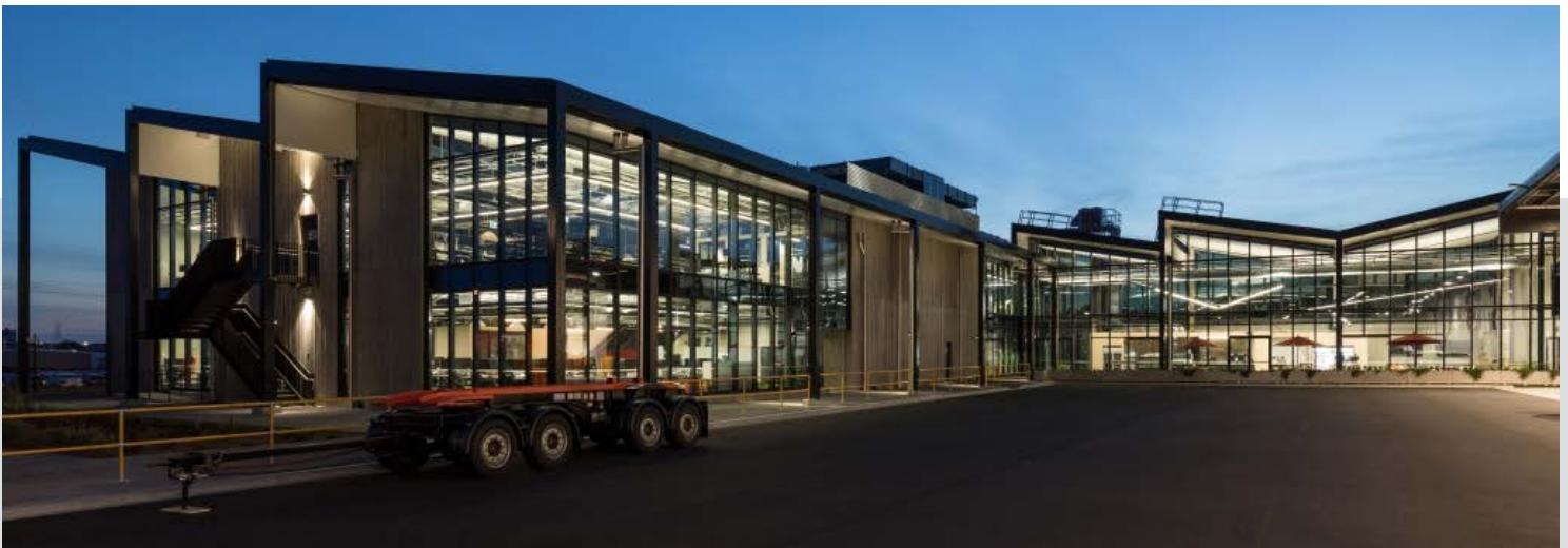
Waste Management NZ, Auckland - PW400 Curtainwall

NOTE: THIS BROCHURE CONTAINS A SUMMARISED VERSION OF BUILDING PRODUCT INFORMATION REQUIREMENTS (BPIR) CLASS 2 DISCLOSURE INFORMATION - OUR COMPREHENSIVE DOCUMENTS CAN BE DOWNLOADED FROM: HTTPS://WWW.THERMOSASH.CO.NZ/DOWNLOADS-RESOURCES/BPIR-DOCUMENTS/