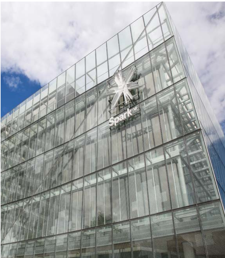
Spark HQ, Christchurch - internal PW400 skin with an external PW1000 skin