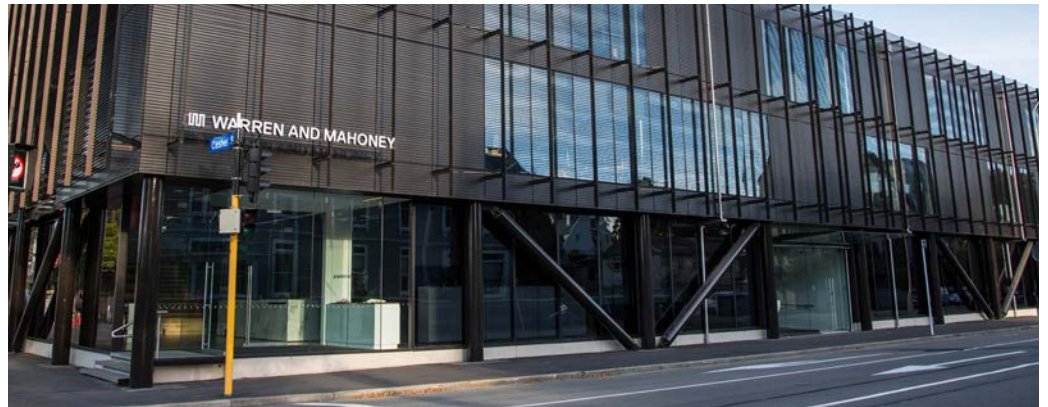
Warren and Mahoney Offices, Christchurch - PW400 Unitised Curtainwall with channel glazing & opening sashes to ground floor