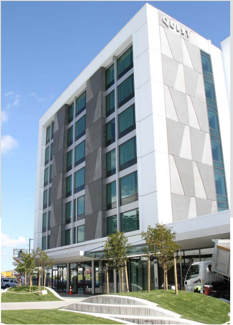
The Crossing, Quest Hotel, Auckland - PW400 Unitised Curtainwall