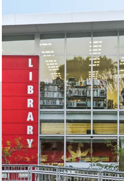
Karori Library WELLINGTON