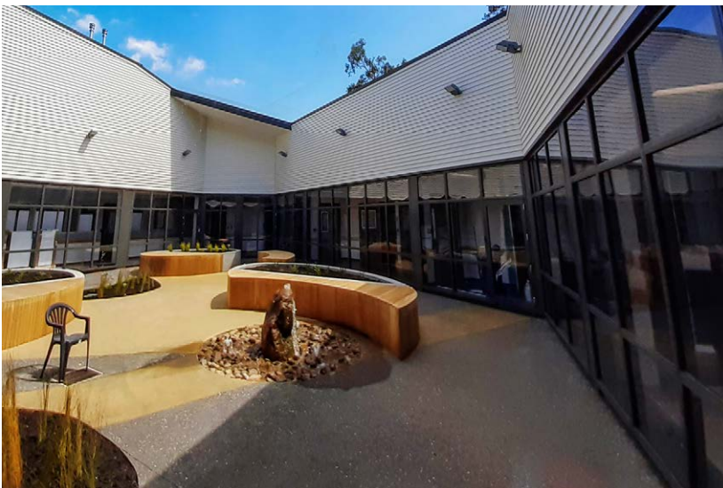
Mason Clinic E Tui Tanekaha, Auckland (for mentally disabled offenders) - the windows provide security and offer a domestic aesthetic to the building.