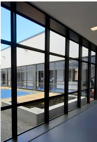
Mason Clinic WDHB AUCKLAND

We exclusively use local powder coaters who have stringent chemical handling processes and reuse or responsibly dispose of all waste powder.