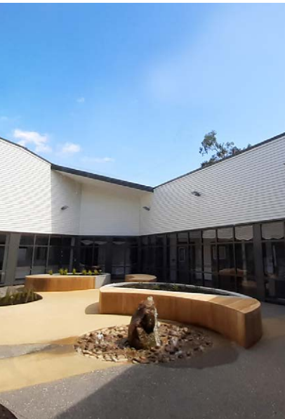
Mason Clinic WDH AUCKLAND

We exclusively use local powder coaters who have stringent chemical handling processes and reuse or responsibly dispose of all waste powder.