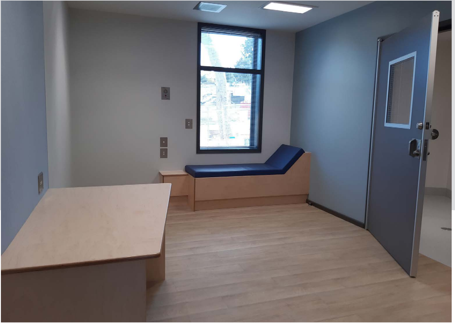
Mason Clinic, Te Whatu Ora, Auckland - DeltaGuard™ security windows with integrated isolated venetian blinds for anti-ligature mitigation.