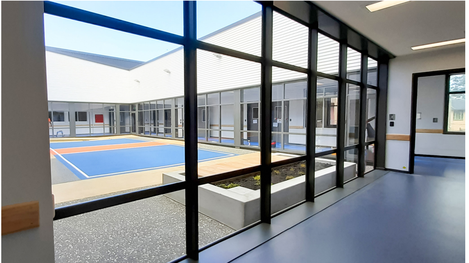
Mason Clinic, Te Whatu Ora, Auckland - DeltaGuard™ security windows surrounding the interior courtyards offering a welcoming yet safe environment.