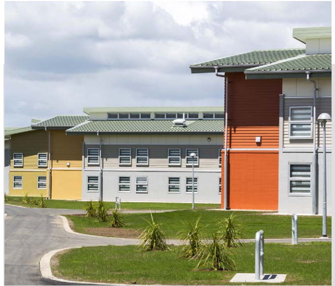
Wiri Prison, Auckland SECURITY WINDOWS WITH BESPOKE SASH WINDERS